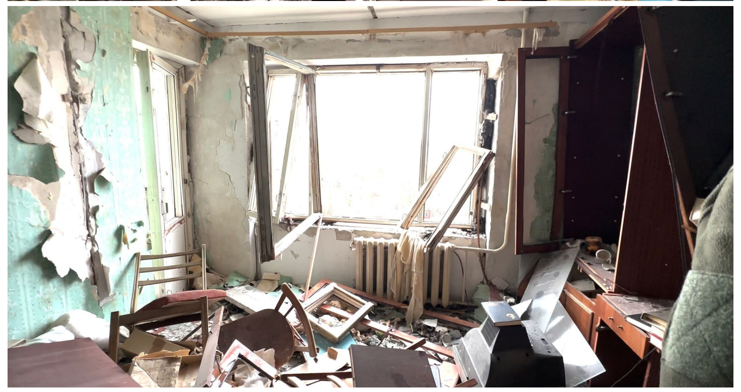
Photos: This children's Bible was found in the apartment that had been bombed. The doors were hanging off their hinges, and windows had blown out from the blast. Even though the apartment building itself was inhabitable, there wasn't a single scratch on the children's picture Bible. The exterior of the building had large holes from the missile strikes and artillery fire.