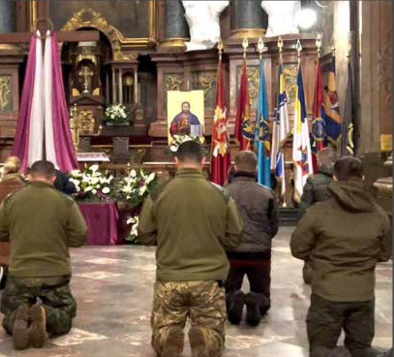
Soldiers were on their knees for an extended period of time praying in total silence.