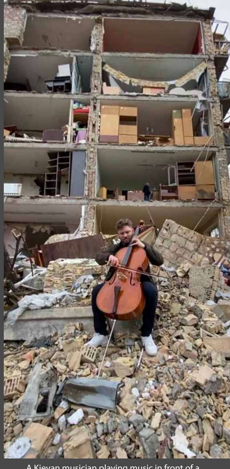
A Kievan musician playing music in front of a building that was shelled by Russian forces.

We are set to print 300,000 copies of our ministry book for refugees. It speaks to a nation traumatized by war. The powerful personal stories in the book are a source of faith, hope and persevering power in life's most devastating storms of which the war is certainly one of biggest Ukrainians will ever face.