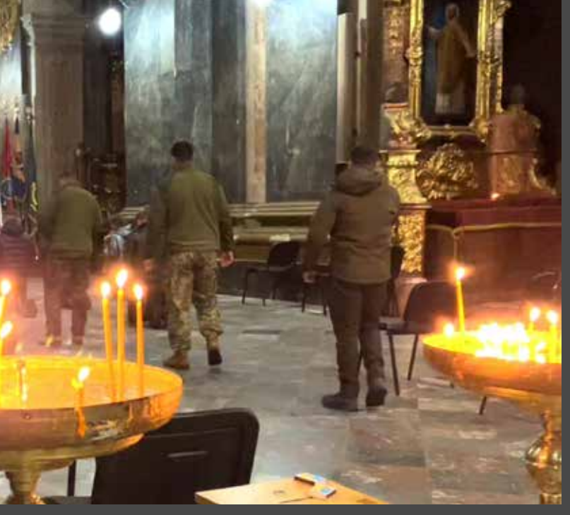
On Good Friday we visited the Cathedral in the city of Lviv. Soldiers came to spend a time of reflection.